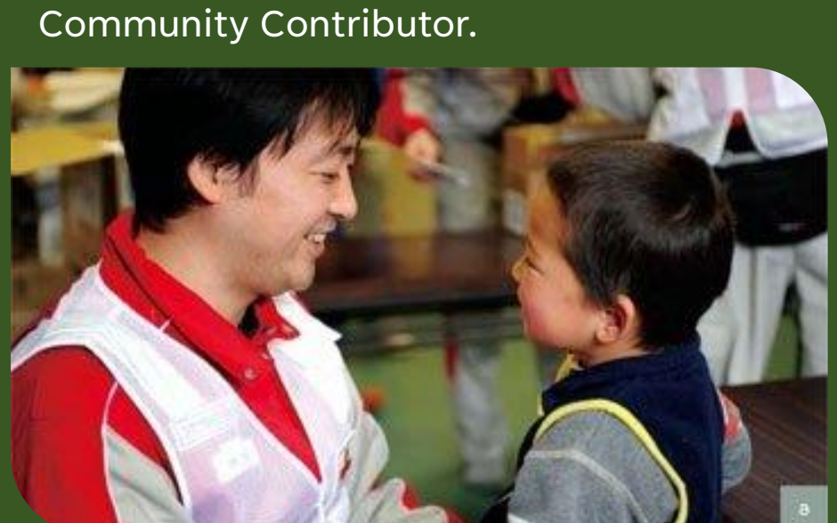
Members of the Public.