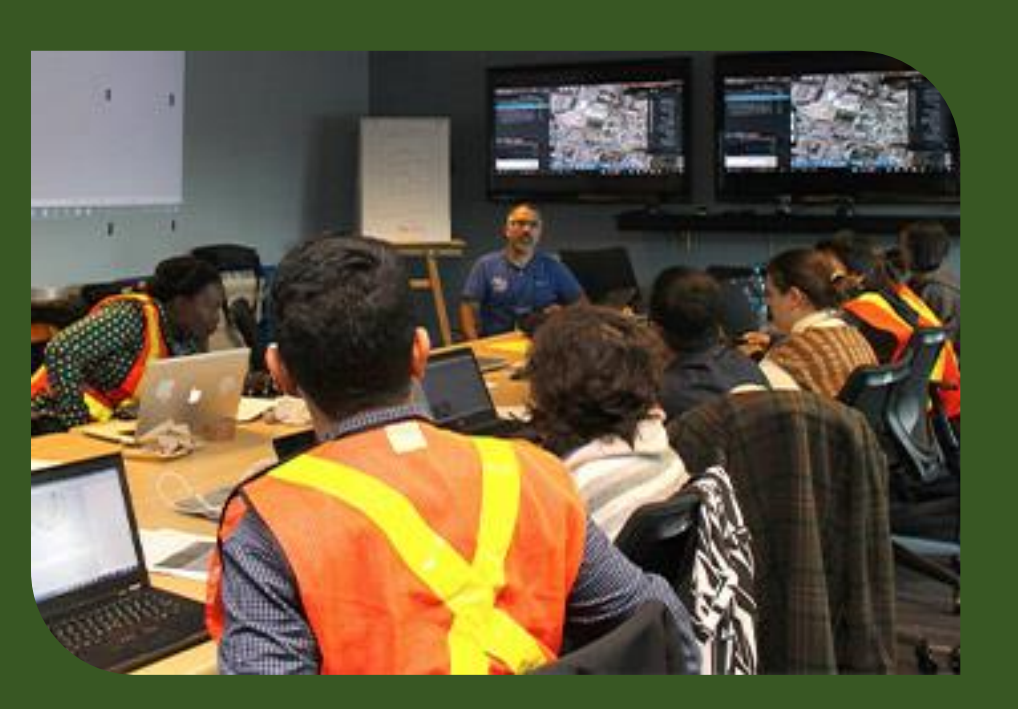
NGO and Uniform Group Personnel.